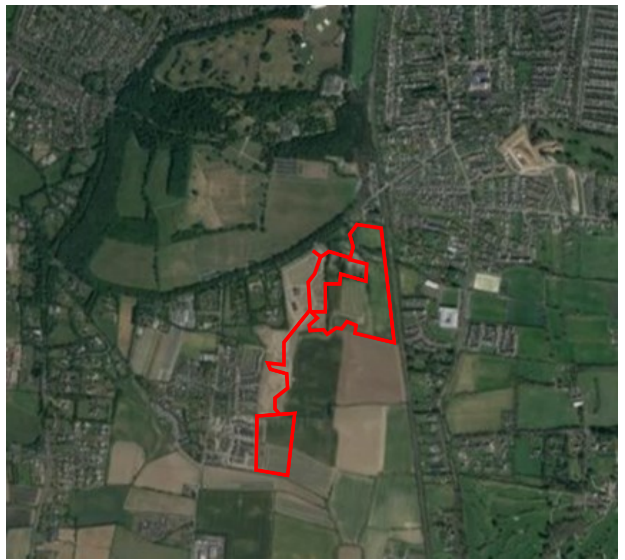
Figure 2. Aerial View of the Application Site (approximate boundaries of the subject site outlined in red)

Hazelbrook and the south of Broomfield. The surrounding area of the lands is predominately characterised by residential development, with agricultural lands to the south and east.