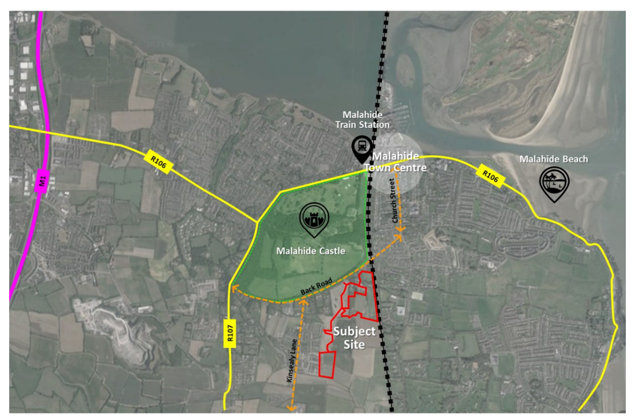
Figure 1. Aerial View of the Location of the Subject Site (approximate boundaries of the subject site outlined in red)

It will form the natural extension to two adjoining, existing developments currently under construction by the same applicant (Birchwell Developments Ltd.), namely Ashwood Hall and Brookfield. These two schemes were planned and are being delivered as part of the development of the Broomfield lands which were subject to the objectives of the Broomfield Local Area Plan (LAP) 2010. The proposed development will represent the completion of the developable lands originally envisaged for residential development within the LAP.