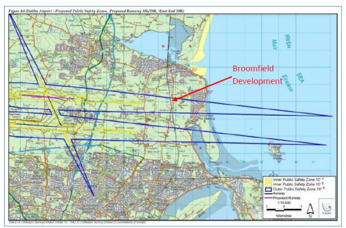
Figure 6. PSZ at Dublin Airport extracted from the Aviation Safety Assessment accompanied by the Application for the Proposed Development

The blue lines in the Figure below depict the outer PSZ, whereas the yellow lines represent the inner PSZ. The southern portion of the Broomfield development lies within the outer PSZ.